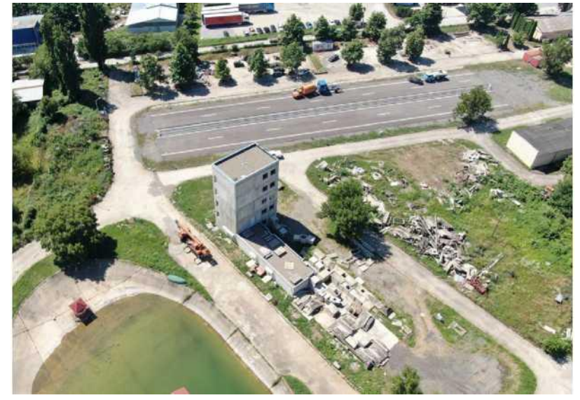
The Montana training centre