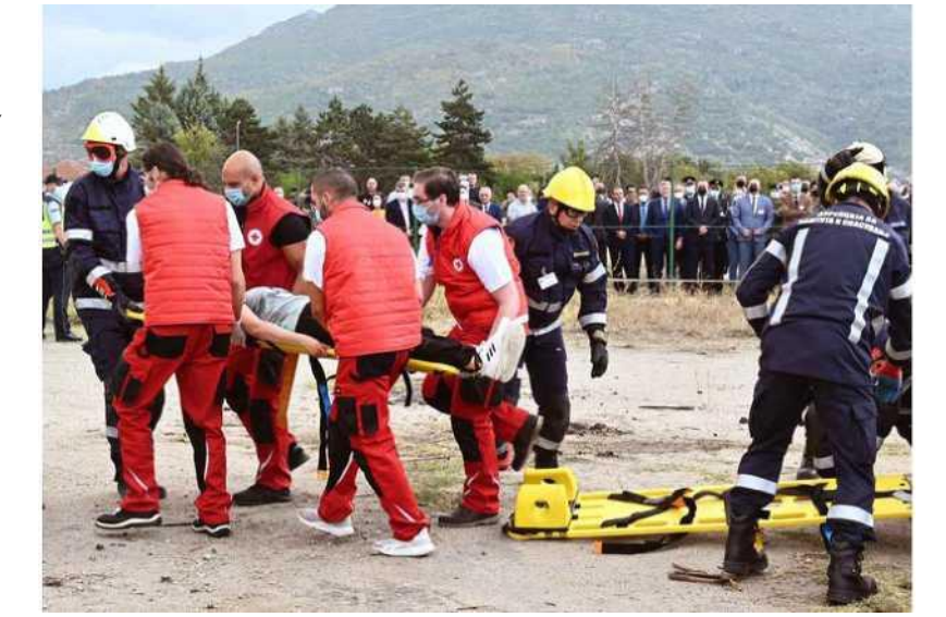
NATO's most recent emergency management exercise took place in North Macedonia in 2021

The initial scenario trigger is a major earthquake, followed by secondary emergencies in the vicinity of Montana. The participants will face realistic challenges, including information manipulation and disinformation, complications related to climate change, population movements, etc.