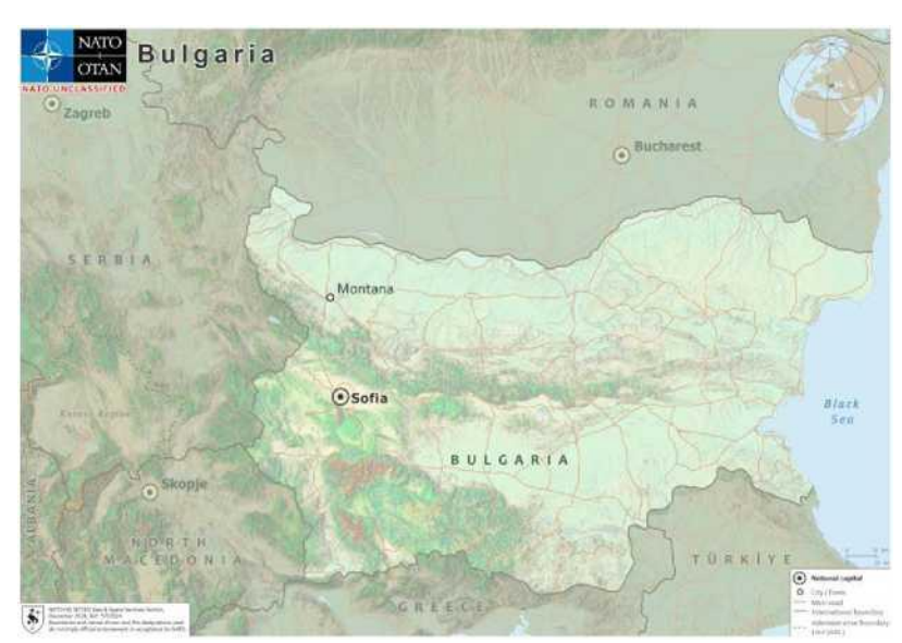
Map of Bulgaria with the exercise location

Allies, partners, and international organisations can use Exercise BULGARIA 2025 to test and validate their response plans, procedures and capabilities, such as in cases of border-crossings in an emergency, or bilateral and multilateral interactions. Prospective participants should identify the assets they plan to exercise and determine the disciplines in which they want to participate.